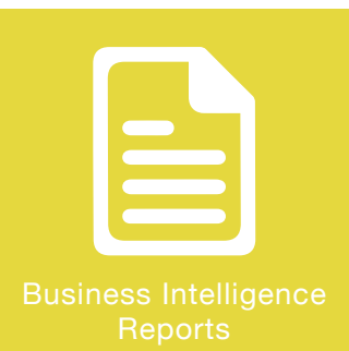
Business Intelligence Reports